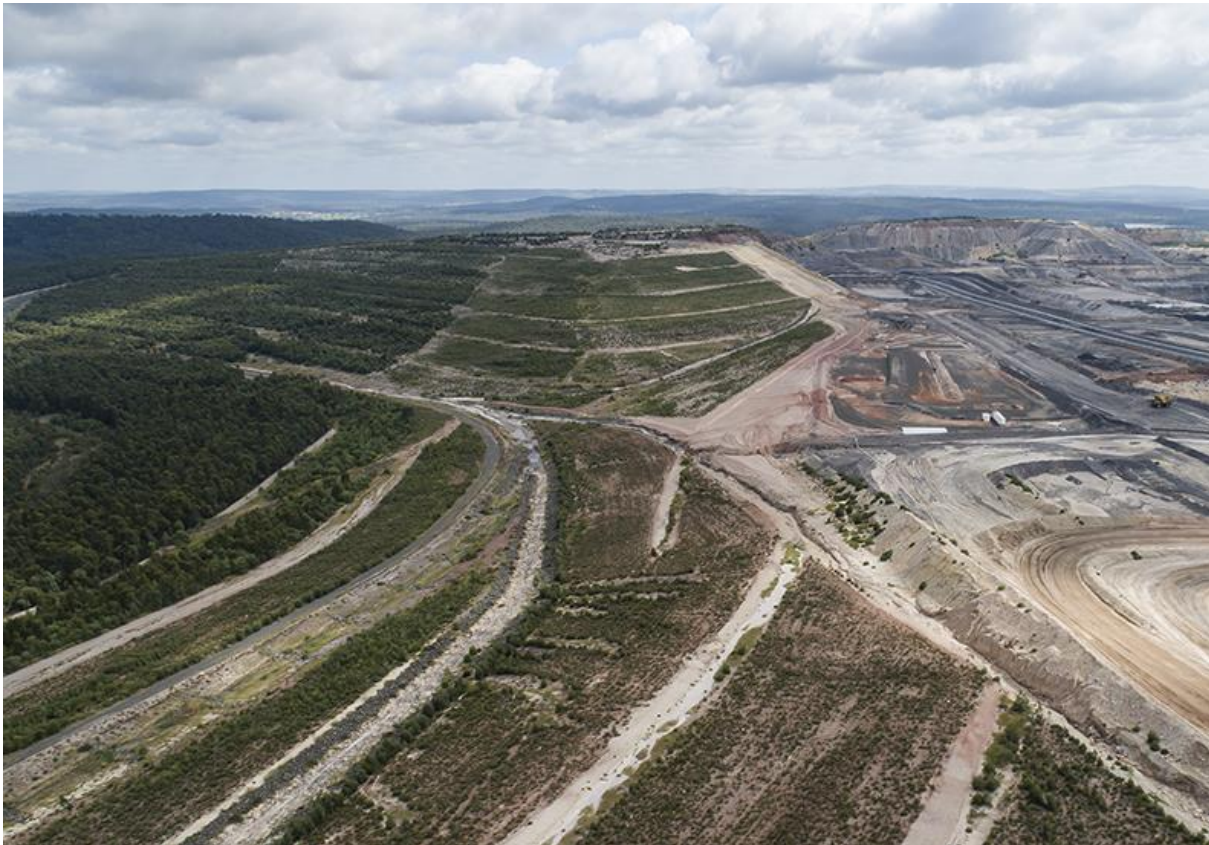
Pictured above: Rehabilitation at Meandu Mine

Many of our people also work on sites owned, controlled or operated by third parties. In circumstances where we perform work on non-BUMA sites, you are expected to comply with BUMA's policies as well as the policies and standards of the third party who owns, controls or operates a site.